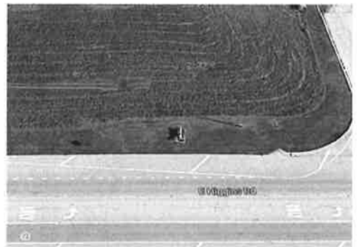
Sign II (Route 72)