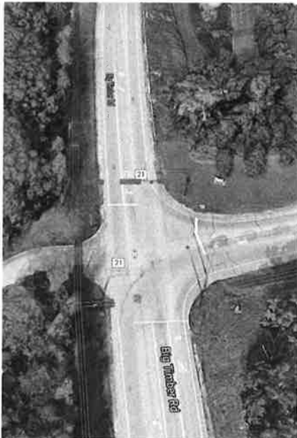
Sign III (Big Timber)

----- Trench Path (or boring path for Sign III)