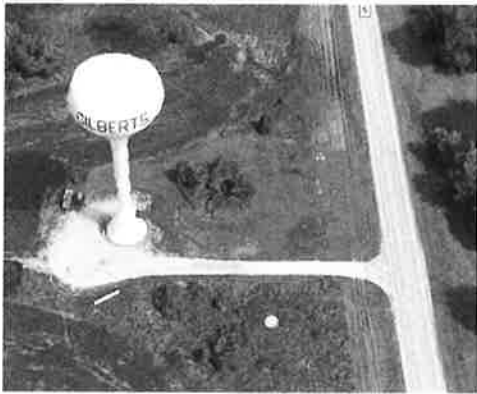
Sign I (Galligan Road)